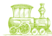
Model Railway Society