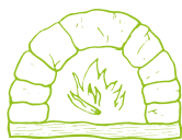
Designers & retailers of wood fired pizza ovens and accessories