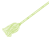
Commercial cleaning for offices and new build properties