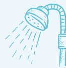
Kitchen and bathroom component wholesaling

Do you have these clients on your books? We’ve created policies recently for businesses working in these areas, so we’re more than up to speed on providing tailored cover that delivers excellent value.