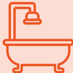
Bathroom furniture wholesaling