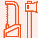
Hardware and ironmongery wholesaler