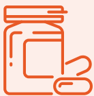
Wholesale and distribution of pharmaceutical goods