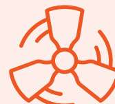
Importer and distributor of fans and ventilation equipment