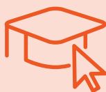
Production of digital learning courses