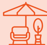
Retail of garden décor, furniture and gifts