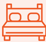
Bed and furniture retailing