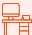
UK administration offices