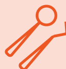
Dental equipment wholesaler