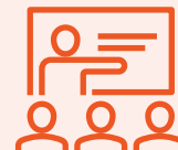
Classroom based training courses