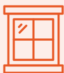
Manufacture of windows, doors and conservatories